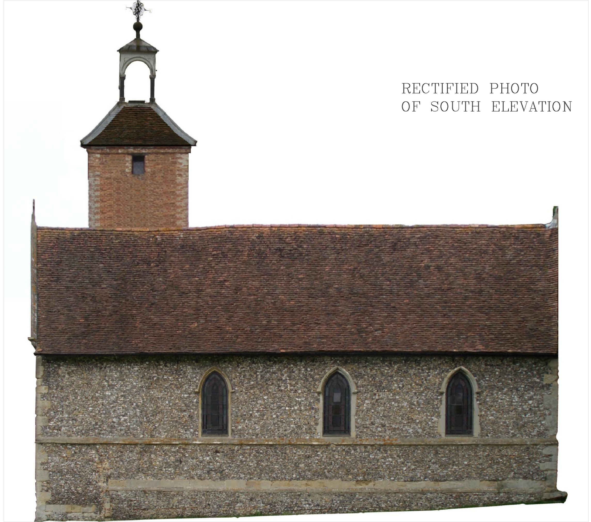
RECTIFIED PHOTO OF SOUTH ELEVATION